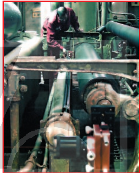
Roll parallel measurements being done by plant maintenance personnel during an unscheduled outage.

The Fixturlaser Roll 200 is an innovative new laser alignment system providing advanced measurement capabilities for paper machines and other roll applications. The system is easy to use for measurement and alignment as well as for documenting the results. The Fixturlaser Roll 200 is built on the same platform used as the basis for other Fixturlaser alignment systems. The Fixturlaser Platform offers the advantage of upgradability to other Fixturlaser products.